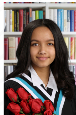
FY23 Junior Comp

Your composite must be purchased before photo order due date, which will be listed on your proofs.