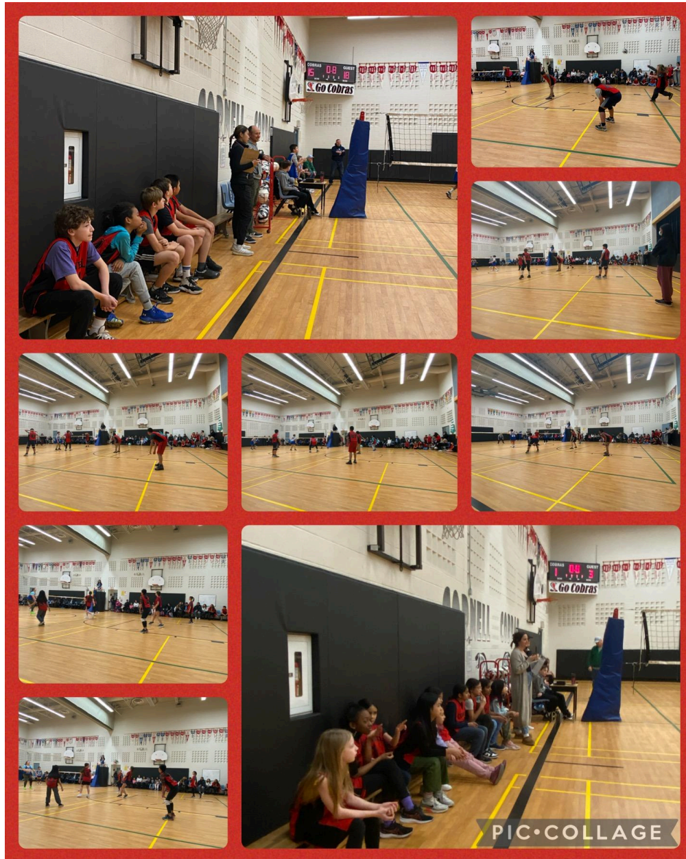
Junior Volleyball games at CVPS!

Reminder Notice - CVPS Grade 8 Grad Photos.pdf